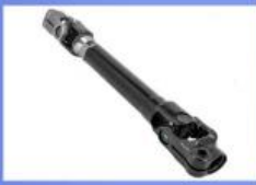
Steering Column Shaft